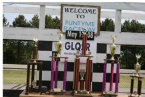
Nice BIG trophies!