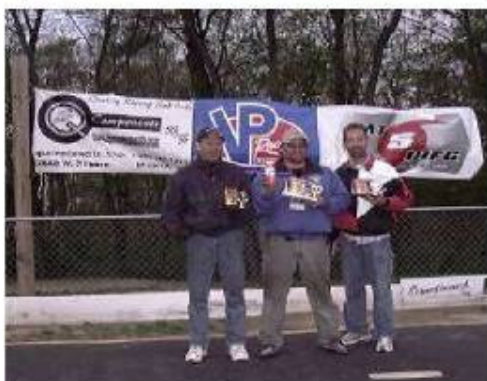
Super Truck Winners