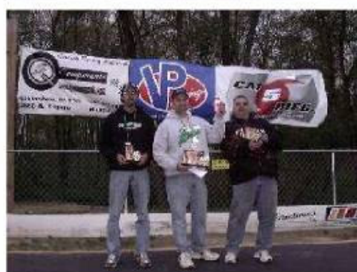
Sprint Car Winners