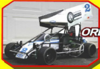
Driver: Todd Hollaway