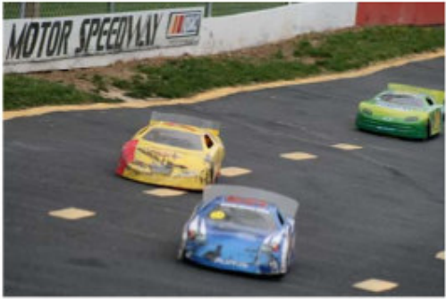
Phil Custance c65 leads the pack in Indy!