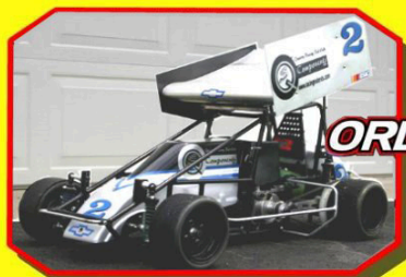
Driver: Todd Hollaway