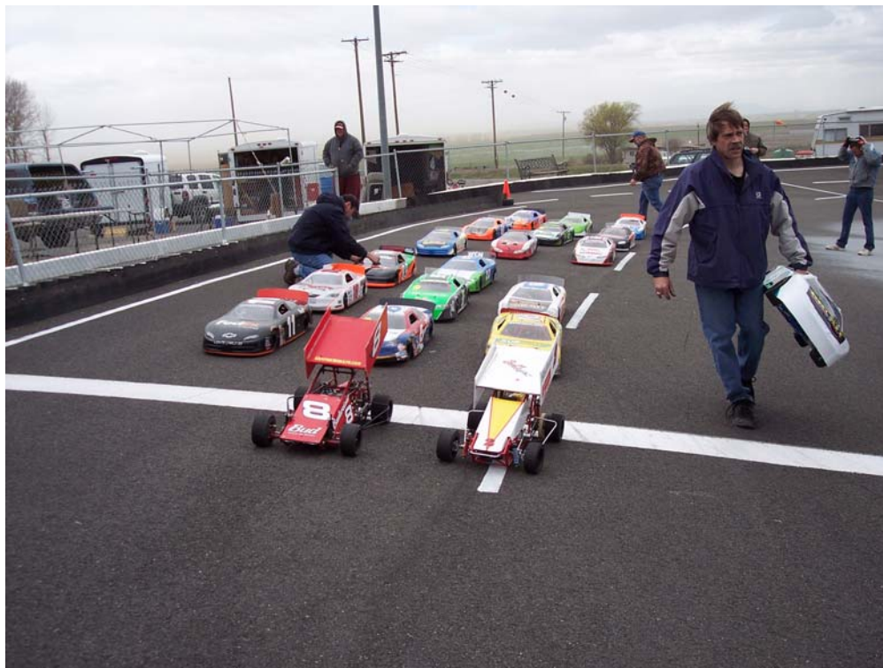
Nice line up!