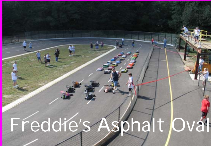
Freddie's Asphalt Oval