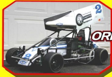
Driver: Todd Hollaway