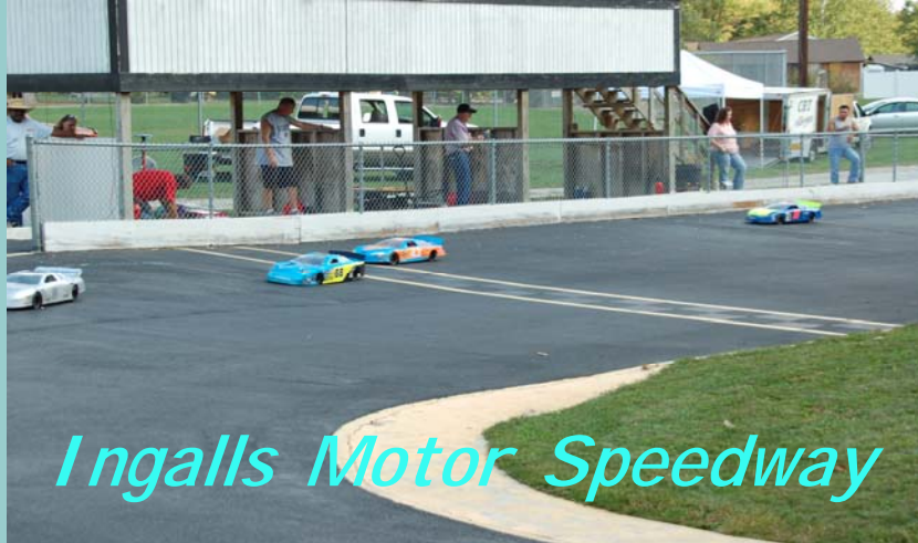
Ingalls Motor Speedway