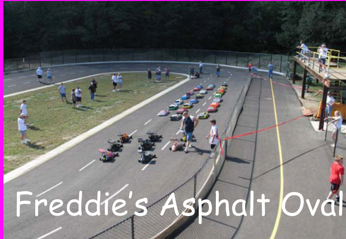
Freddie's Asphalt Oval