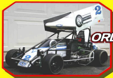
Driver: Todd Hollaway