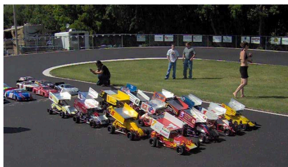
NCS Field of Cars at Algona – Cornbelt Host Track